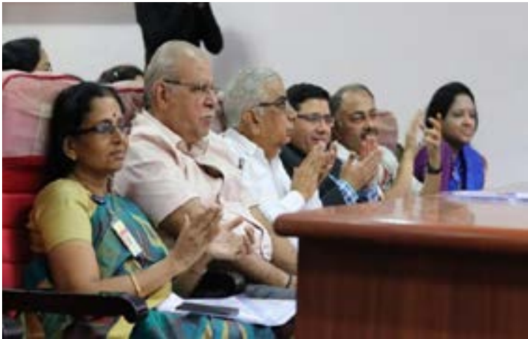
Principal Mam, Vice Principal Mam with trustees and chief guest