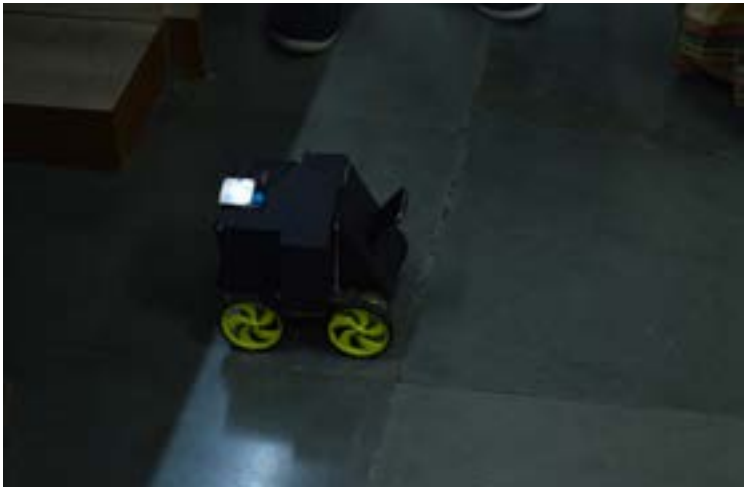
Robot made by ETRX group

Every year VESIT-MCA comes with different and innovative theme for technology day. Theme of the technology day, 2017-18 was “Digital India-Socio Economic Impact and Challenges.” Digital India Programme is an initiative of Government of India, which aims to transform India into digitally and economically empowered society. Vision of Digital India Centred on 3 Key Areas: Digital Infrastructure as a Utility to Every Citizen, Governance & Services on Demand, and Digital Empowerment of Citizens. The department of MCA aimed to create an awareness of Socio Economic impact of Digital India and inspire the students to contribute to the cause. The Event aimed to provide a forum to exchange ideas on the latest developments and future directions in Digital India-Socio Economic Impact.