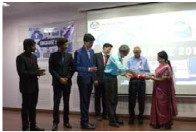
Release of ISA magazine