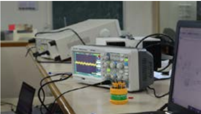
ETRX B.E Project