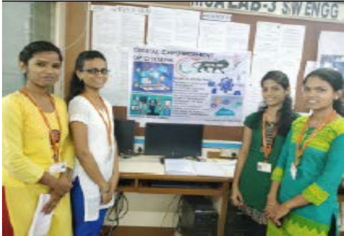
MCA B.E. project presentation