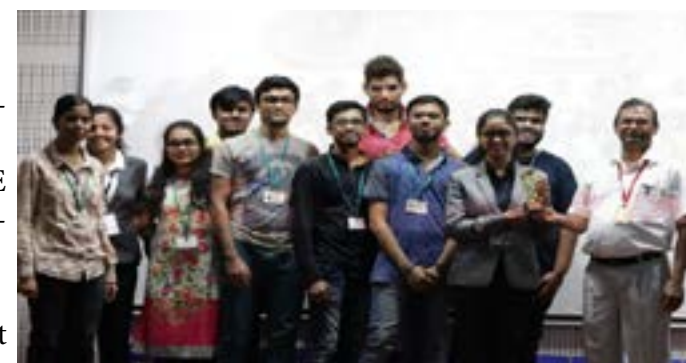
Best class of the year(S.E.)-D10

The final event of the academic year was a one worth remembering for all ISTE members as they were not only members of the council, but a family.