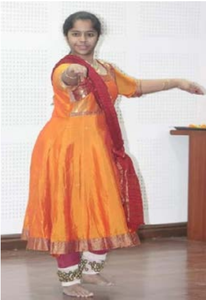
Solo Dance Performance