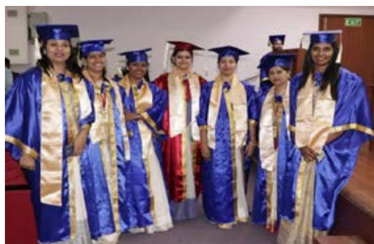
CMPN dept. teachers