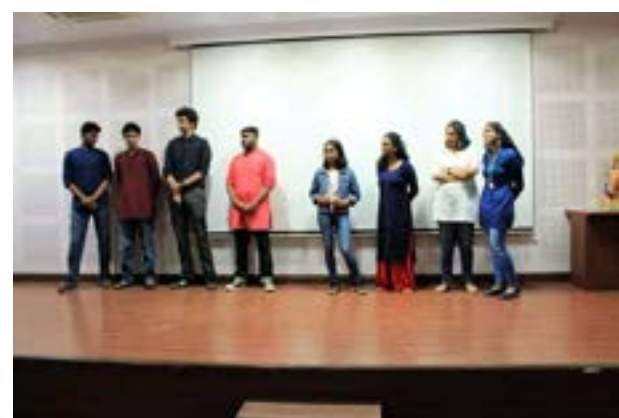
Drama Performance by D7