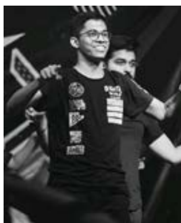
BE's in their featured dance

The clashes in timings were handled really well by the council and no competitor had to take any stress about being in two places at the same time. The evening of the last day was marked by a very emotional signing off of the Members of the Council, with the Secretary of each council giving their heartfelt message. This was followed by the signing off of our College's General Secretary and President. The event obviously ended with the DJ blowing the roof off the place. With a lot of excitement, emotions and fun, the last event of this academic session came to a conclusion.