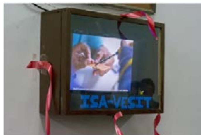
The digital notice board.