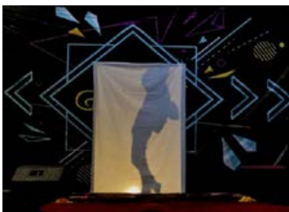
D1's showstopper dance performance