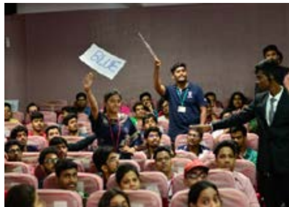
The 'Quizzards of VESIT'