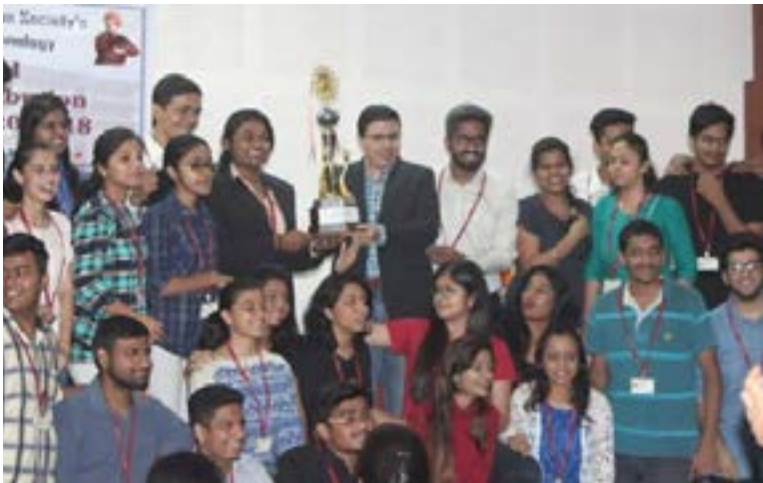
Spurthi Winners (D14)