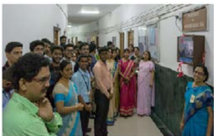
Staff members present at the event