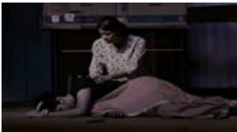
D7’s drama performance

Again, one of the most exciting events that are looked forward to by a majority of people at VESIT, Drama is a much hyped event, at which many class try a hand at, but only the ones who are able to put in rigorous amounts of work and determination manage to make a mark. The forming of the Drama team as a whole is ever so challenging, with the casting being very crucial, and delays happening all the time along with creative clashes over different point of view. But D7C from juniors overcame all these hurdles to clinch the first prize with their splendid idea and execution, paired with teamwork and par excellent acting. They were followed by D10 and D7. The experienced Seniors gave us exhilarating performances and the winners were D18 and D16 at 1st position and D20 at 2nd place, with D17C and D14C tying for 3rd position. The Seniors were truly very enthusiastic and took our breath away.