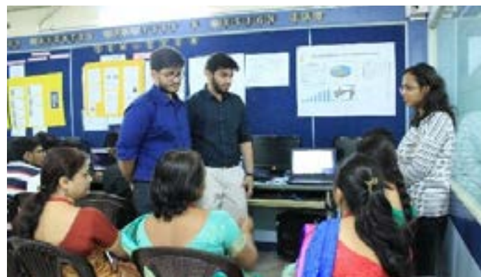
B.E Project display

Following Events are the new introduction to this year' activity under the Code Cell which aims to motivate the skill of innovation among students: