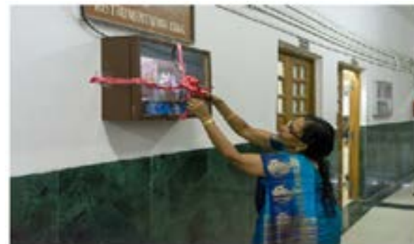
Inauguration of board by our Principal.

On 20th March 2018, Digital Notice Board was, set up for the first time, by ISA council-VESIT. The Notice board is placed right next to the library. The inauguration of the notice board was done by our Respected Principal. ISA-VESIT is the very first council to have a digital notice board of its own. The notice board would henceforth be used for displaying the following : All the events that took place throughout the year. The winners of each event. Announcements of all upcoming events by ISA