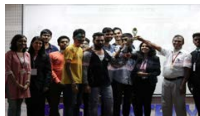
Best class of the year(T.E.)-D15

The student members of ISTE VESIT were then awarded with various prizes for their hard work, coordination and utmost dedication which made each and every event the success it was.