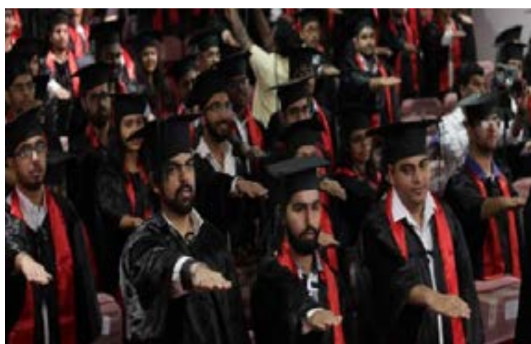
CMPN dept. students taking an oath