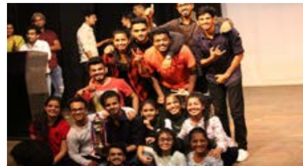
Vesit dance crew