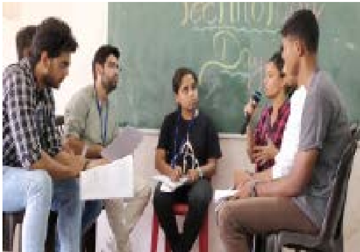
MCA panel discussion