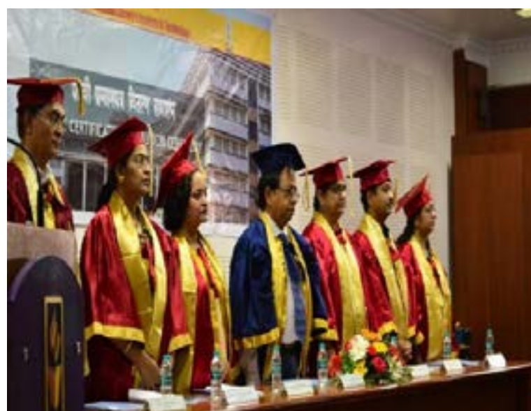
ETRX dept. teacher