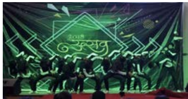
Vesit Dance Crew performing in Utsav