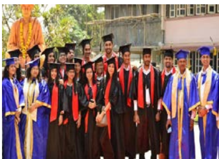
Few ETRX dept. students